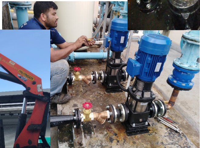
• Booster Pump Systems

Aceflo Engineered Systems On-Site • Installations • Testing & Repairs