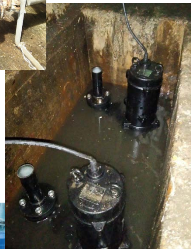
• Submersible Pumping System