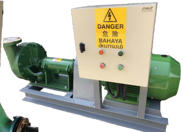
• Modular Chemical Processing System