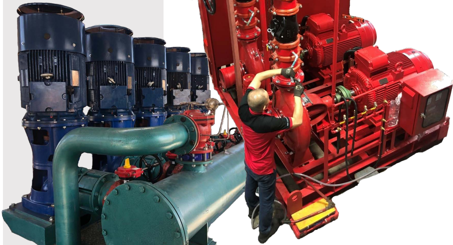
• Modular Irrigation System