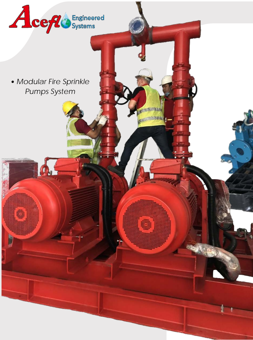
• Modular Fire Sprinkle Pumps System