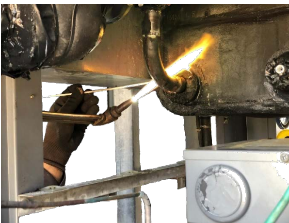
On Site Welding & Repair