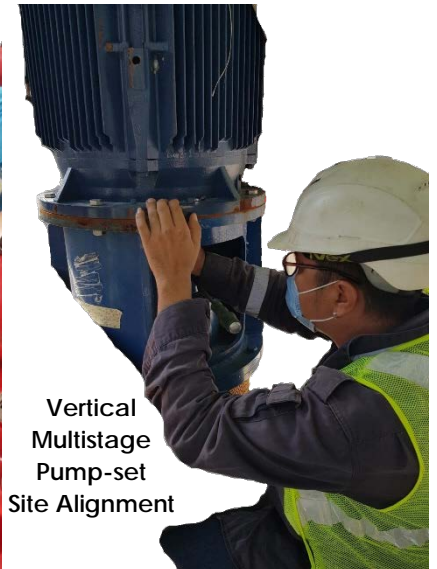
Vertical Multistage Pump-set Site Alignment