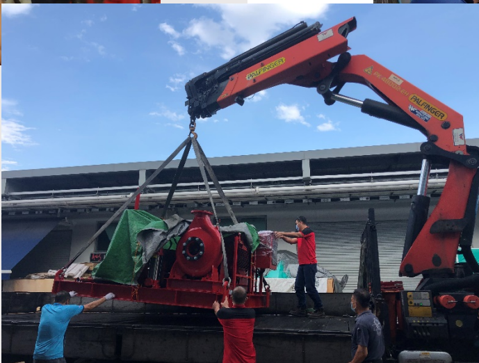
• End-Suction Fire Pumps