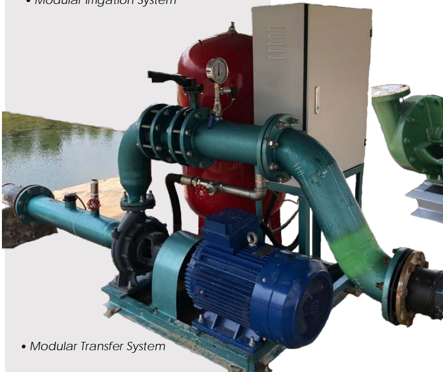
• Modular Transfer System