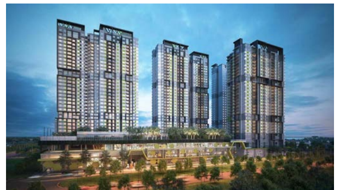
Location: FELIZ EN VISTA, DISTRICT 2, HCMC, VIETNAM