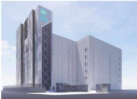
Location: CHINA MOBILE INTERNATIONAL, DATA CENTRE, SINGAPORE