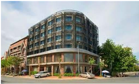
Location: ALMOND BASSAC HOTEL PHNOM PENH, CAMBODIA