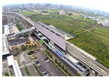
Location: INTERNATIONAL AIRPORT ACCESS MRT SYSTEM, TAOYUAN, TAIWAN