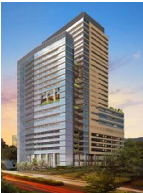
Location: NATIONAL CANCER CENTRE, SINGAPORE