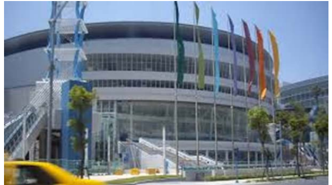
Location: KAOHSIUNG ARENA, TAIWAN