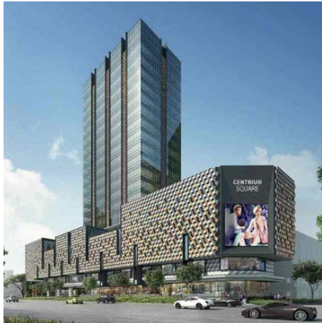
Location: CENTRUM SQUARE MALL, SINGAPORE