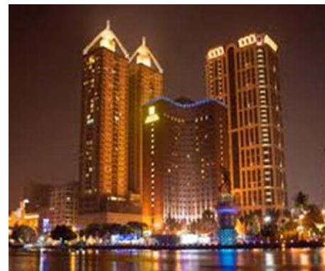
Location: THE AMBASSADOR HOTEL, TAOYUAN, TAIWAN